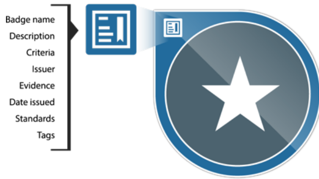
Figure 2. What's in an Open Badge