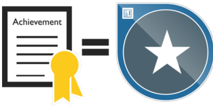
Figure 1. Badges are a web-enabled version of the traditional credential.

To realize the full potential of a badge-based ecosystem, it is important that the interactions around badges are open—not proprietary.